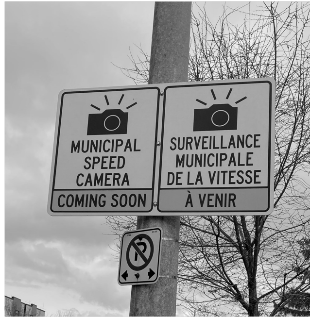
A speed camera in front of D. Roy Kennedy School will be one of 15 installed across Ottawa in 2022. According to its Traffic Service Catalogue, the City receives more than a thousand inquiries each year from across Ottawa requesting that action be taken to address speeding.

To request enforcement of speed or report speeding issues, residents can call the Ottawa Police Service at 613-236-1222 x 7300, or report online at www.ottawapolice.ca