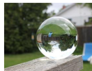
Backyard fun in a world turned upside down.

Winter Fun Day Saturday, January 30 (TBC) Kingsmere Park